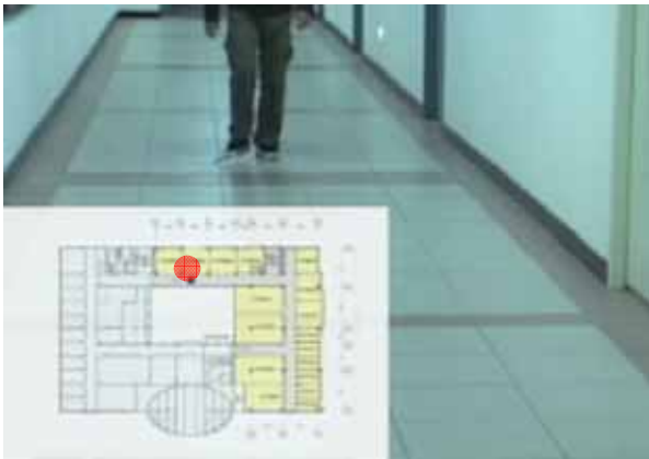
Figure 3. Location tracking of GETA sandals.

The footprint location system has a drawback that positioning error accumulates as the number of footsteps increases. It is inevitable that a small amount of error is introduced each time we take measurements to calculate a displacement vector. Consider a user has walked n steps away from a starting point: his/her current location is calculated as a sum of these n displacement vectors, the current location error is also the sum of all errors from these previous displacement vectors. In other words, the error in the current footprint measurement will be a percentage of the total distance traveled. To bound this error accumulation, we utilize a RFID reader at bottom of left sandal, and place a small number of RFID tags with known location coordinates in the environment. When a user steps on a location-aware RFID tag, the RFID reader reads off the correct coordinate from the tag; therefore, bounding the error in the footprint location system. Although these location-aware RFID tags are infrastructural components, they constitute only light infrastructure, given that RFID tags are relatively inexpensive in cost ( < \$1 each), and they are relatively easy to install by most people. Based on our current measurements, the error without RFID tags is approximately 1%